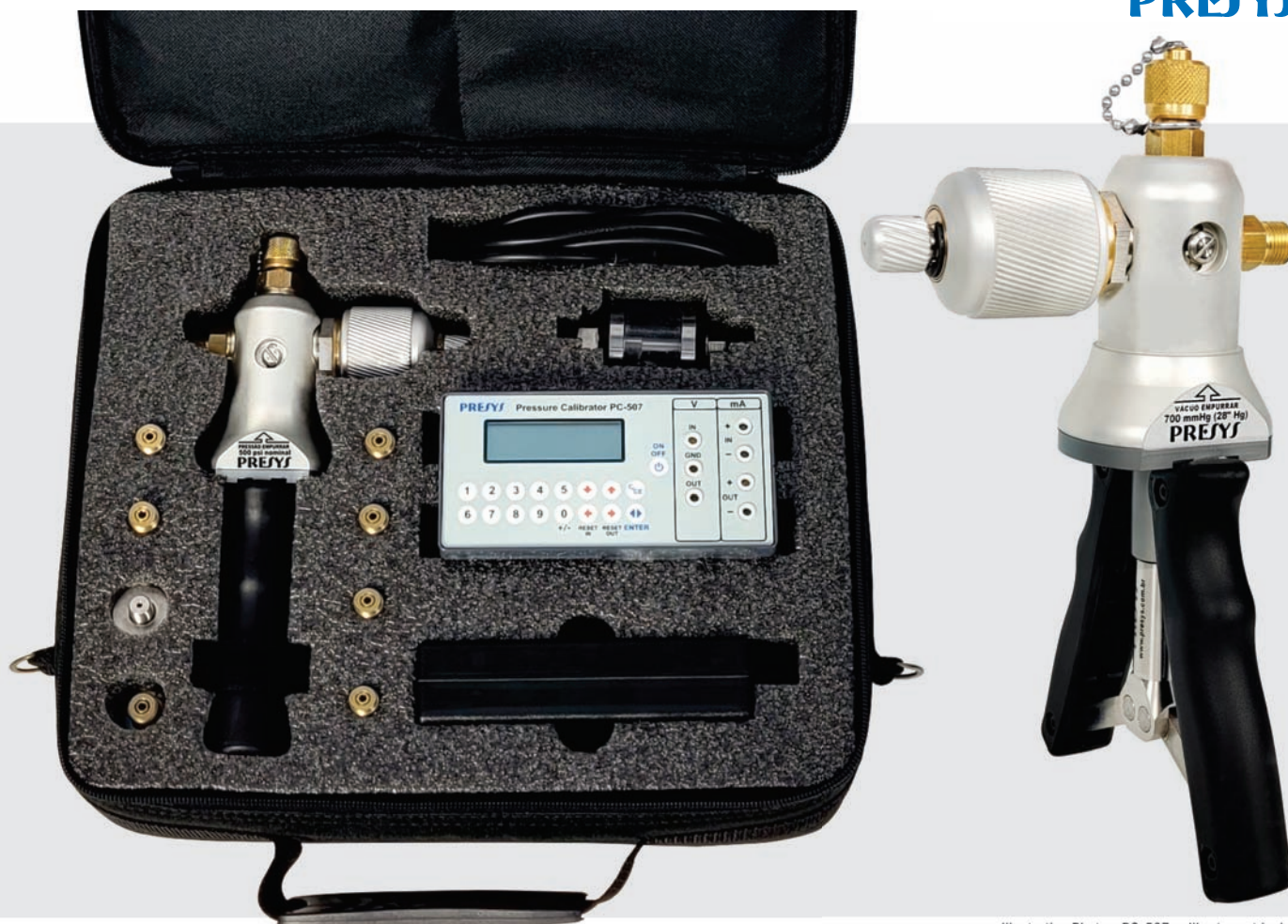
Illustrative Photo - PC-507 calibrator not included.