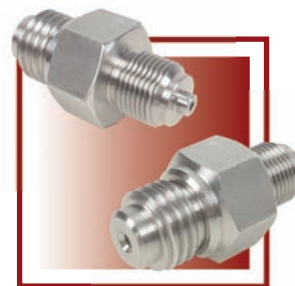
3/8" BSP Male Adapter for 1000-bar High-Pressure Hose