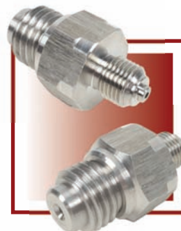
1/4" BSP Male Adapter for 1000-bar High-Pressure Hose