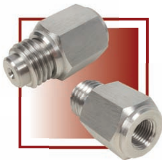
1/4" BSP Female Adapter for 1000-bar High-Pressure Hose