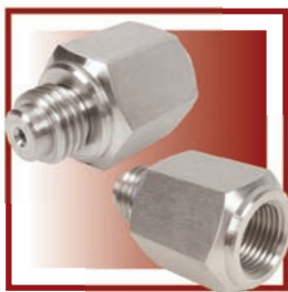
1/2" BSP Female Adapter for 1000 bar High-Pressure Hose

PRESYS high-pressure hose fittings have a maximum working pressure of 15,000 psig (1,000 bar) and are manufactured from AISI 316 stainless steel, with nitrile rubber O-rings, ensuring high mechanical strength and excellent performance in industrial applications.