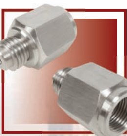
1/2" NPT Female Adapter for 1000-bar High-Pressure Hose